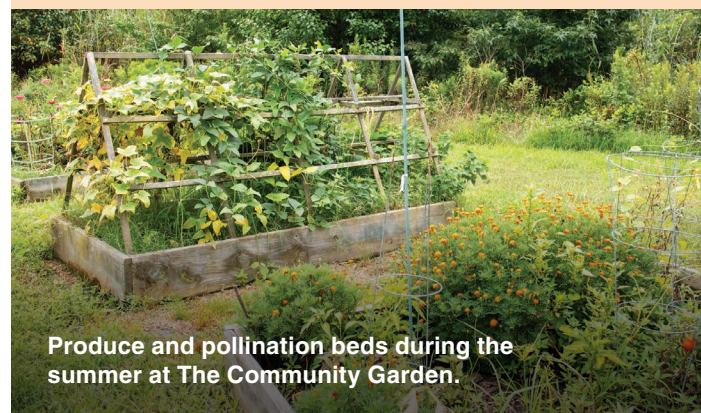
Produce and pollination beds during the summer at The Community Garden.

The gardeners love hearing compliments from passers-by on Dam Neck Road, and soon, they hope to expand the garden, recruit new volunteers, and restore it to its original low-maintenance beauty. This group effort truly puts the "community" in Community Garden.