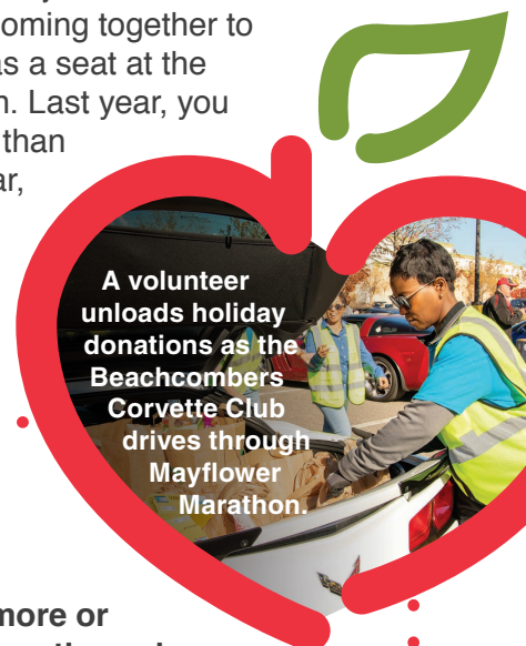
A volunteer unloads holiday donations as the Beachcombers Corvette Club drives through Mayflower Marathon.

Mayflower Marathon is not just about donations — it's about coming together to ensure that everyone has a seat at the table this holiday season. Last year, you helped us provide more than 756,000 meals. This year, we're hoping to surpass that milestone, and with your help, we believe we can.