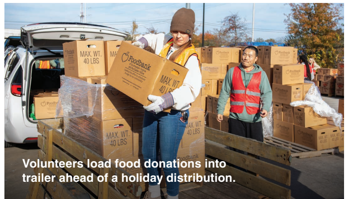
Volunteers load food donations into trailer ahead of a holiday distribution.

But the work doesn't stop when the marathon ends. All food collected is swiftly distributed to our partner agencies, ensuring that families receive the