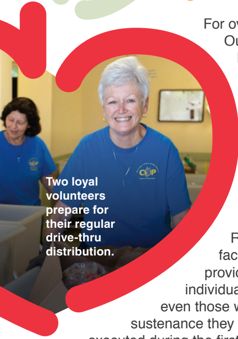
Two loyal volunteers prepare for their regular drive-thru distribution.

For over 30 years, the Isle of Wight Christian Outreach Program, a Foodbank partner agency, has been a source of strength for our Western Tidewater community, a rural area that poses significant challenges in food access. Their food distribution program is at the heart of this effort, offering nutritious food to those who need it most, three days a week. Each distribution includes shelf-stable products, fresh produce, protein, and a bakery bag comprised of food rescued from local retailers, tailored to the size of each household.